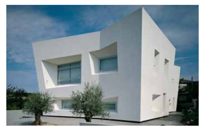
Office building Lumenart, Croatia, Pula Architect: Rusan Arhitektura, Croatia, Zagreb

The carrier board of the StoVentec R system forms an excellent adhesion primer for facade renders with numerous textures as well as grain sizes. It is formable in such way that even bent surfaces can be cladded perfectly. When it comes to colours, the StoColor System provides a wide range of design options. Even very dark facade surfaces pose no problem. Besides facade renders, StoDeco Profiles and Rustications, the StoVentec Carrier-Board Facade is also perfectly suited for the application of ceramics (StoVentec C), glass (StoVentec G), glass mosaic (StoVentec M) and natural stone panel tiles (StoVentec S).